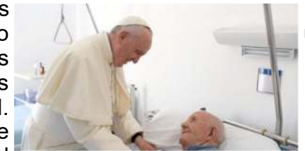
World Day of the Sick

We can sometimes question God's goodness when we or those close to experience sickness. This is especially true if sickness involves considerable pain or is prolonged. However, sickness and suffering are part of what it is to be human. God does not promise that our lives here will be free of suffering and what transforms that reality is that Christ has come and shared in that reality. The miracles in the Gospel are signs that Christ, through his death and resurrection, overcomes suffering and death. As Christians we are called to have a different understanding of suffering which enables us to unite ourselves with the suffering of Christ. This does not mean that we should not pray to God for the sick and for ourselves, but it does give us a different perspective, one based in hope and trust in God's compassion.