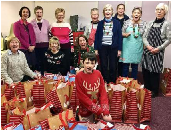
The team who prepare and serve food at the LuvPreston Drop-In with the Christmas Bags for all their clients. Re-starts 2 Jan.