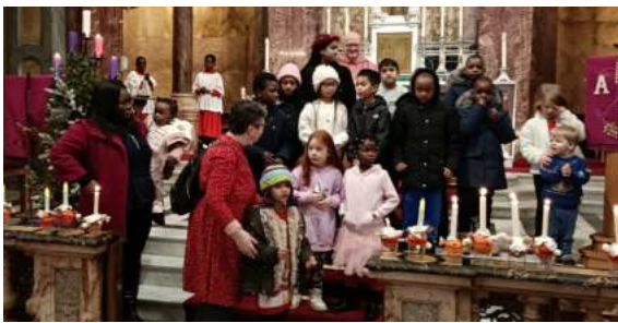
Children from Little Church took part in a Christingle service last Sunday. They brought up their Christingles and sang a beautiful carol.

Metanoia Wednesday Evening Clothes DropIn will be as usual on Wednesday 27 Dec in the Narthex of the Church.