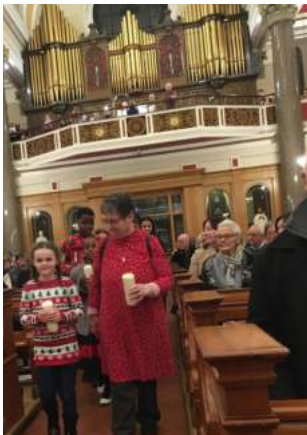
Our annual Carol Service at St. Wilfrid's was a joyful occasion. There was a mixture of traditional and modern carols performed by our four choirs to accompany the readings of the Christmas story. Thank you to everyone who took part, the singers, readers instrumentalists and the backroom volunteers who made it run smoothly.