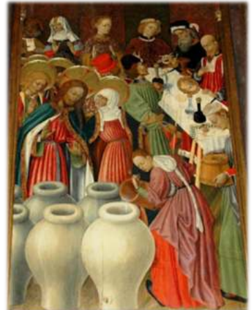
Bernat Martorell (1390-1452)

There is one other thing we might take away from today's Gospel. Those words of Mary to the servants, "Do whatever he tells you". This scene show us we can do that with confidence.