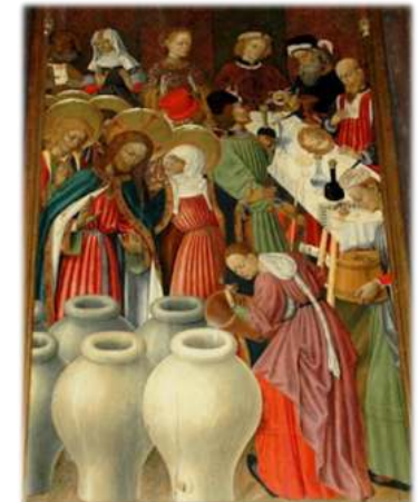
Bernat Martorell (1390-1452)

There is one other thing we might take away from today's Gospel. Those words of Mary to the servants, "Do whatever he tells you". This scene show us we can do that with confidence.