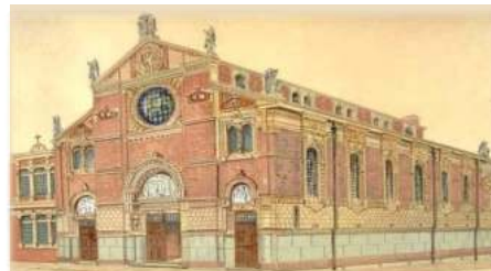
St. Wilfrid's Parish, Preston