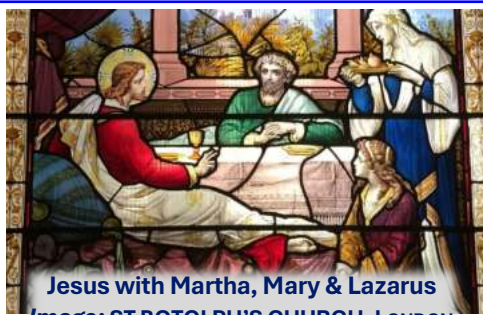
Jesus with Martha, Mary & Lazarus

Next week we celebrate the fairly recent feast of Martha, Mary and Lazarus. They were great friends of Jesus whom they invited to their home and felt able to call and ask for help when Lazarus died. As a family they are the patron saints of siblings so maybe on Monday you might pray for your brothers and sisters.