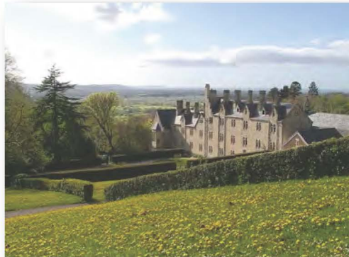
St Beuno's, Denbighshire June 2018