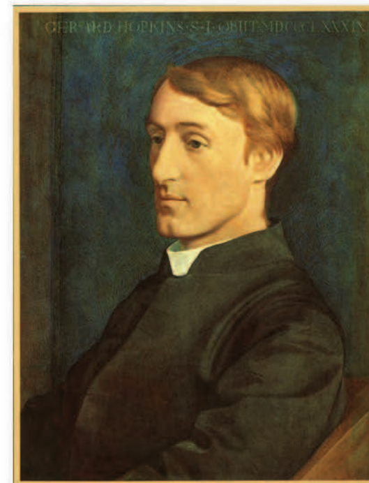
Gerard Manley Hopkins 1844 -1889 Poet

'The world is charged with the grandeur of God.'