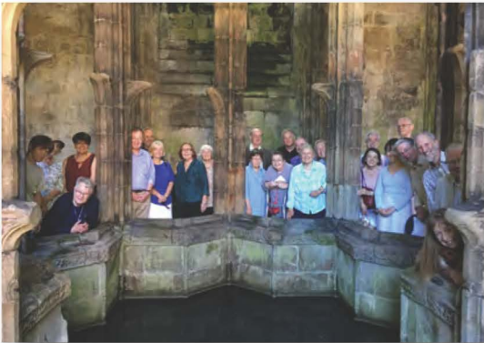
St Winefride's Well, Denbighshire June 2017