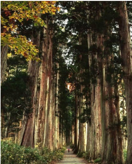
Cedars

This is particularly true in this time when Pope Francis is calling us to the virtue of hope. There are many ways we can look at ourselves and at our world and find it difficult to hope. It can be difficult to see the goodness when we are aware of our own weakness and of the violence in the world around us. However, today's readings call us to trust in God. Ezekiel and the psalm use the image of the cedar, planted by God, to illustrate how he has worked for his people. In the Gospel Jesus uses those images of the growing seed to show how God is at work for us. Let us ask for the gift of hope and trust we pray, "Thy kingdom come". Let us also look